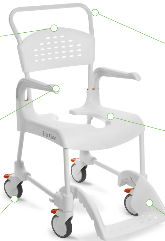
Clean, standard model

Unique legrest that is folded in underneath the chair when not in use. Curved footplate for comfort and relaxation.