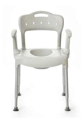
Swift Commode without pan

The pan with a tight-locking lid, fits smoothly and becomes one with the seat. The pan has a handle in the back as well as an upright handle that automatically locks the lid when carried.