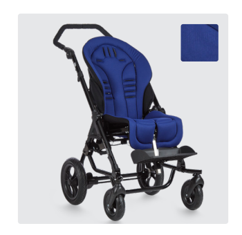
Blue cushions For size 1 and 2 - also comes in a mesh option.