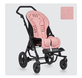
Pink cusions Only for size 1.