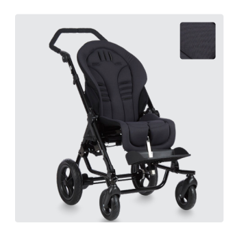
Grey cushions For size 1 and 2 - also comes in a mesh option.