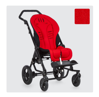
Red cushions For size 1 and 2 - also comes in a mesh option.